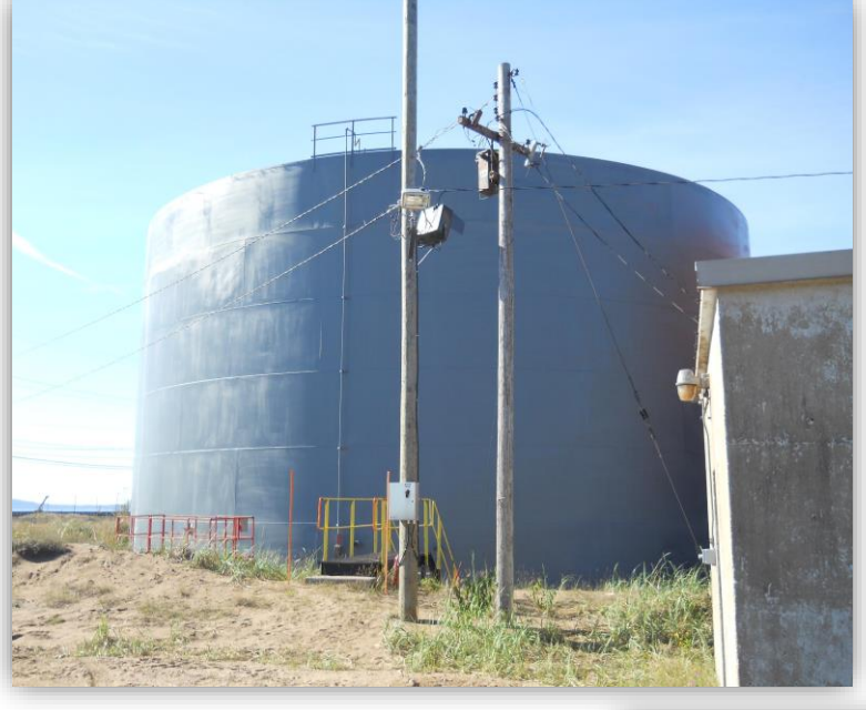
Realized in 2009 for Rio Tinto.

Reservoir containing liquid calcium chloride.