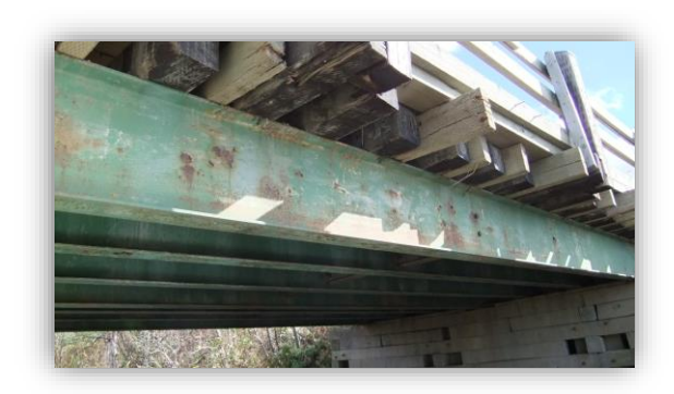
Quebec - Canada Bridge - Steel / Wood - MTQ

The refurbishing of a retaining wall on the Trans-Canadian highway completed in 2017.